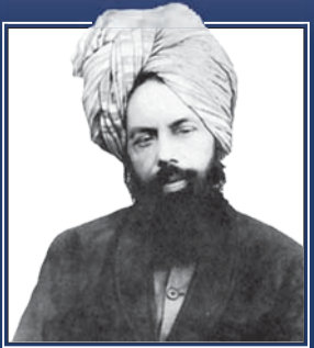
Hadhrat Mirza Ghulam Ahmad (1835-1908) The Promised Messiah as and Imam Mahdi, the Founder of the Ahmadiyya Muslim Community

A dhrrat Mirza Ghulam Ahmad as , holy founder of the Ahmadiyya Muslim Community, claimed to be the Promised Reformer (The Mahdi and Messiah) whose advent was awaited under different names and titles by the adherents of various religions.